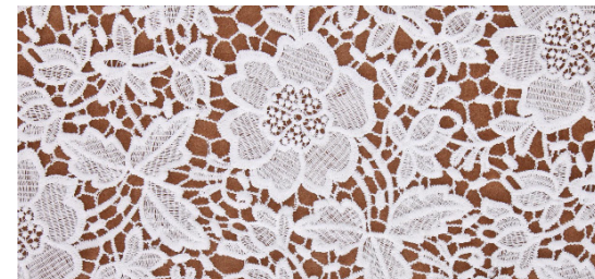
涤 / 锦花边 Polyester/Nylon Lace