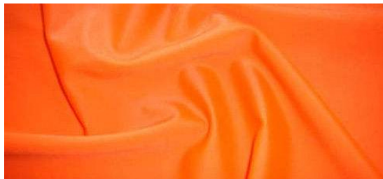
泳衣 / 内衣 Swimwear/Underwear

The SHF is suitable for a wide range of knitted and woven fabrics. Due to its high versatility, it is particularly recommended for synthetic or cellulose fiber blends in knitted and warp-knitted fabrics.