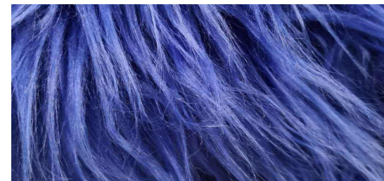
绒布 / 长绒棉 Flannel/Long Staple Cotton