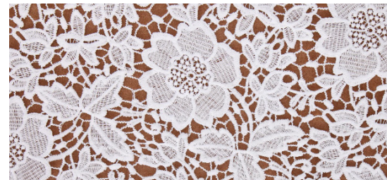
涤 / 锦花边 Polyester/Nylon Lace