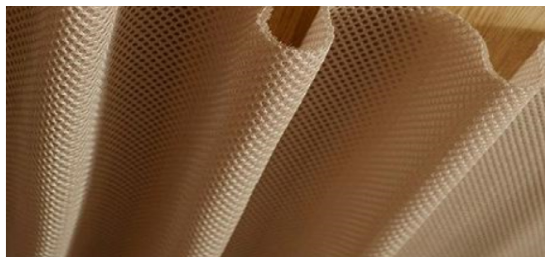
涤纶鞋材 Polyester Shoe Material